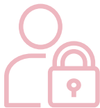
Managed Security Services