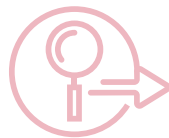
Managed Detection & Response