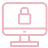
Cyber Security Solutions

Our Security First approach means that we prioritise security in everything we do. We empower our clients to make informed decisions about their cyber security, ensuring that they have the knowledge and tools they need to protect their businesses. With Integrity360, cyber security becomes an enabler for modern business, not a hindrance.